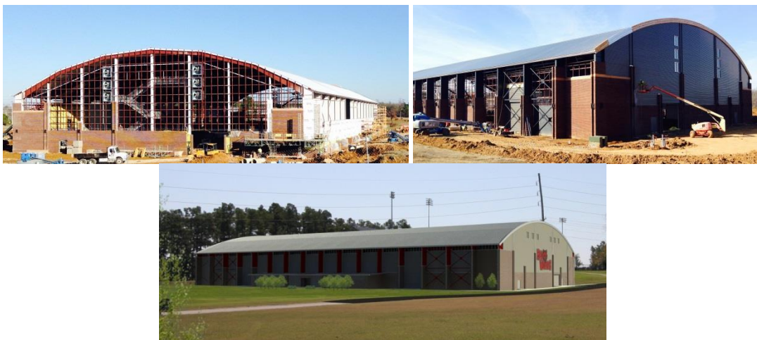
Architectural Rendering of Completed Facility